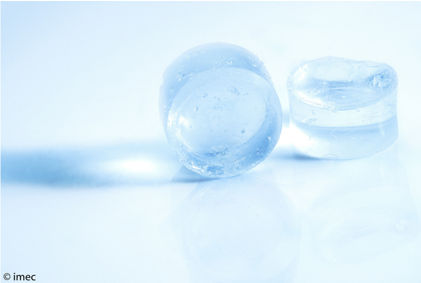
Imec and Panasonic's new electrolyte