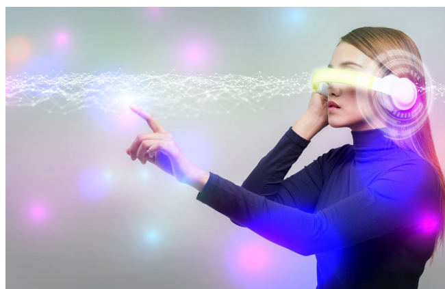
The 140GHz radar's ability to sense gestures enables intuitive interaction between human and device.