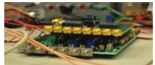
Receiver board (DBB and FPGA)